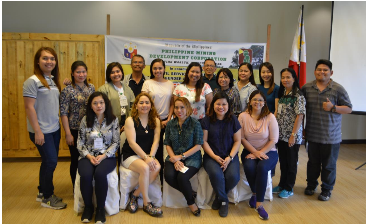
(PMDC's GAD Focal Point System Members with Resource Speaker)