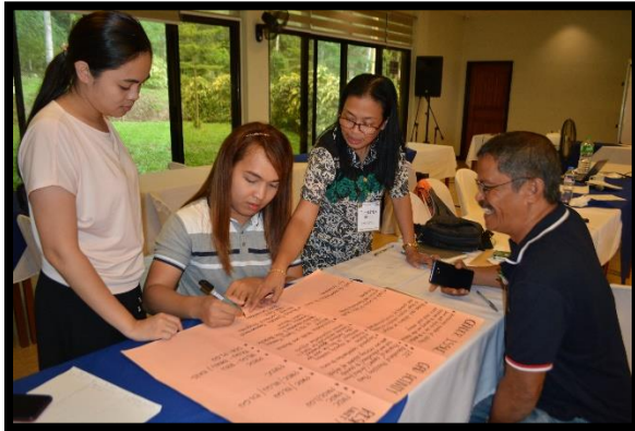
Workshop on GAD Planning

As one the country's GAD Learning Hubs, Davao City through the Integrated Gender and Development Division has indeed provided significant assistance through its technical services extended to NGAs and companies like PMDC.