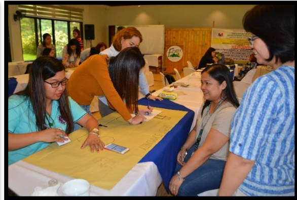
Workshop on a Gender-Fair Society