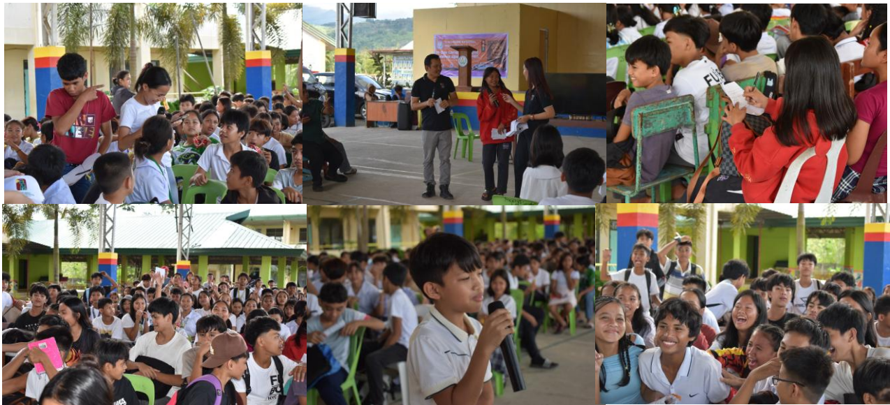
Question & Answer portion during the Awareness Campaign at Tubo Tubo National High School

The activity concluded with an interactive question-and-answer session, where students actively participated and received IEC materials as incentives for correct responses, reflecting their strong interest and engagement throughout the campaign.