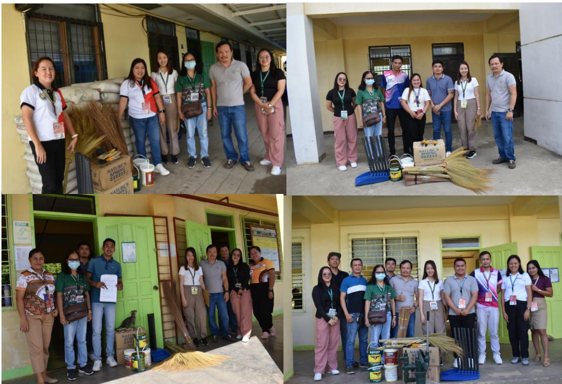
Turn-over of the construction and cleaning materials and equipments for Brigada Eskwela 2025

School officials expressed their appreciation for PMDC's continued assistance. The Community Relations Officers also conducted brief consultations with teachers to better understand their priority needs and programs. School representatives likewise requested the continuation of similar support in the coming years to further enhance the students' learning environment and academic performance.