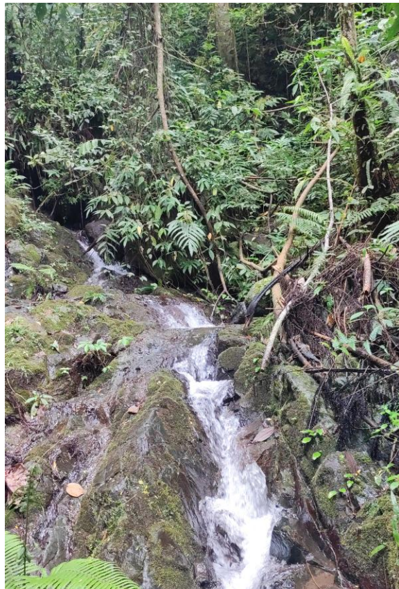
Mabatas Water System