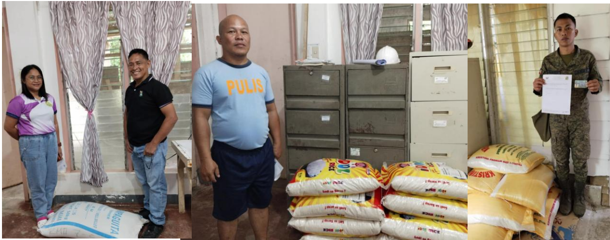
Photos during the turn-over of the rice to Mt. Diwata BHS, PNP and AFP