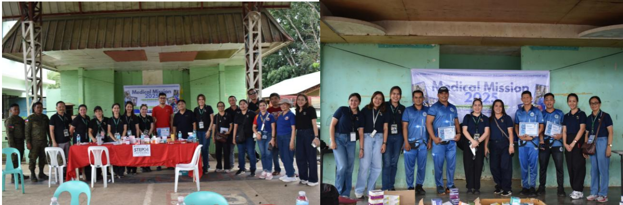
Action photos during the medical, dental mission, circumcision and good groomig activity

PMDC Medical Mission 2025: Enhancing IP and Non-IP Women's, Children, and Men's Health by providing accessible medical, dental and circumcision activity to the Residents of Brgy Tuburan and Pigsag-an, Cagayan de Oro